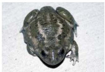
Great Basin spadefoot toad

The NCPN has completed NPSpecies certification at Arches NP for six taxonomic categories—birds, mammals, reptiles, fish, amphibians, and vascular plants—and has posted the results on its website. An interactive application allows users to select a desired taxonomic category and an alphabetic sort function (i.e., by common name, scientific name, or family-scientific name). Additionally, users can search