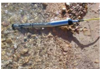
Water quality sonde/NPS

At Arches NP, the NCPN is cooperating with park staff to collect water quality monitoring data used to assess condition and trends relative to the Clean Water Act, human health, and ecological function. Monthly monitoring visits between January 2005 and January 2007 indicated that 4 of 7 sites sampled did not meet state standards for secondary contact and warm water game fish species. Low dis-