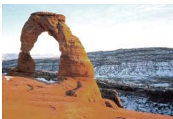
Snow at Delicate Arch

Climate plays a crucial role in regulating biological and physical processes; rainfall and temperature are the primary factors that limit an ecosystem's structure and function. The NCPN compiles and analyzes climate data from an existing weather station in Arches NP. Over the past 26 years, Arches NP has shown an increase in average annual maximum tem-