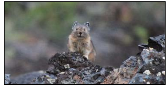
Pika ( Ochotona princeps )

Localized extirpations of the American pika ( Ochotona princeps ) have recently been documented in isolated mountain ranges of the Great Basin. The hypothesized mechanism for these extirpations is increased warming resulting from accelerated climate change. Given the current predictions of climate change over the next century, the risk of extinction is now considerable, and the species is currently under review for listing under the Endangered Species Act. The lava flow environments found at CRMO provide a unique and potentially critical habitat type for pikas. The cool microclimates in the deep cracks and crevices of the lava flows allow pikas to survive despite extreme summer surface temperatures. These flows are extensive, which may permit a larger and more genetically diverse population to persist than those in highly fragmented montane environments. Consequently, CRMO could be a regionally significant refugia for pikas if warming over the next century occurs as predicted and the need for establishing a baseline against which future population change can be detected is clear.