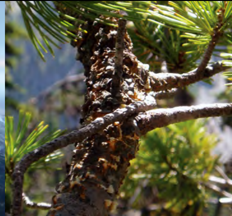
LEFT Dead whitebark pine among subalpine fir in North Cascades National Park.